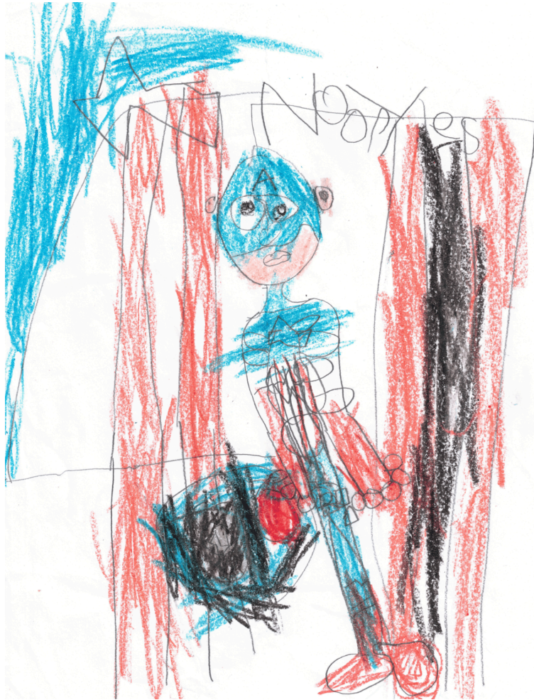
Original artwork by Finn Rotert (age 5)